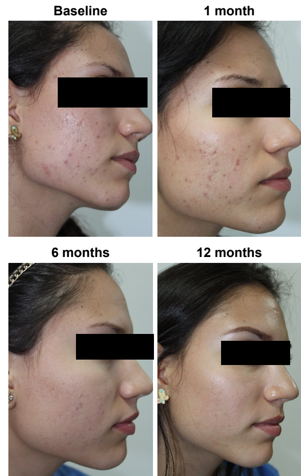
Figure 3 Photographs of the reduction in acne lesions.

15–45 years with low doses of ethinylestradiol 20 µg and other progestogen (drospirenone 3 mg) also had an effect in reducing inflammatory and non-inflammatory lesions. 24 The ethinylestradiol dose of 20 µg was selected in combination with dienogest in this study.